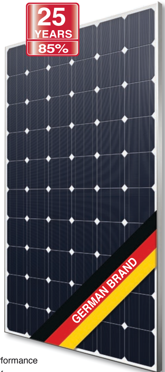
Fig. similar 60M156EN160428A

Exclusive linear AXITEC high performance guarantee!